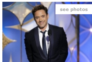
The 2014 Celebrity 100