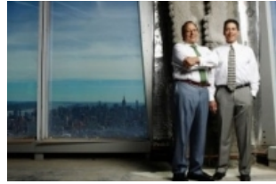
For Dursts, World Trade Center Deal Is A Pinnacle

FORBES' ranking of the richest families, pinning down 185 billion-dollar dynasties collectively worth $1.2 trillion.